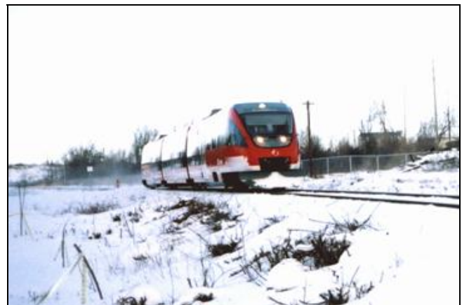
The project enabled Bombardier to test the Talent DMUs in a cold climate

Each train is equipped with two four-stroke diesel engines, water-cooled in-line motors, and a horizontal-shaft design with exhaust gas turbocharger and charge cooler. Top speed is 120 km/hr.