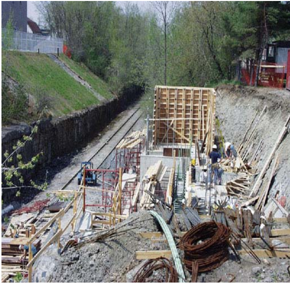
The Carling Avenue station under construction.