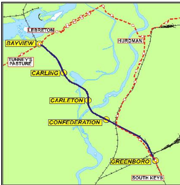
The O-Train runs from Bayview (north) to Greenboro (south), passing Carleton University, a major employment centre, and a busy shopping mall

The original jointed track was upgraded but caused problems such as damage to the trains and excessive noise. It also made the ride uncomfortable for passengers. Instead, OC Transpo installed continuous welded rail in the summer of 2003 at a cost of $2.2 million, adding to the original capital budget for the project.