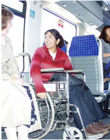
The disabled community enjoys full accessibility on the O-Train

Accessibility. The trains operate in a freight corridor and since freight trains are wider than the Bombardier trains, it was necessary to install flip-down platform extenders to allow wheelchair access. The extenders are lightweight, but strong enough to hold a wheelchair, and are easily flipped back on top of the platform when freight trains use the line.