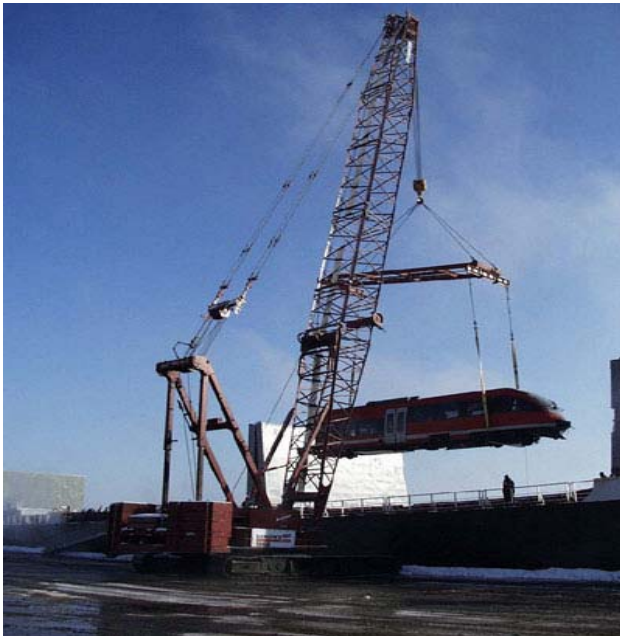
The trains arrive at the Montreal harbour from Germany

Engaging the community. A Light Rail Pilot Project Sounding Board was created and consisted of representatives from community associations and schools near the line, special interest groups, and major employment centres. Other businesses and institutions that would be affected by the project were also consulted. The Board sought input from these stakeholders on issues of customer security, noise, and accessibility.