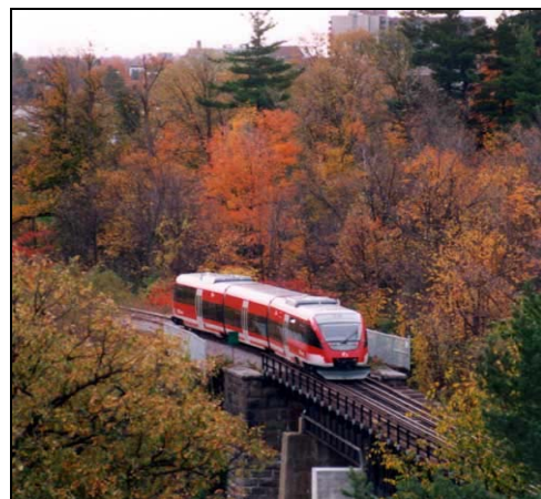
The O-Train uses low-sulphur diesel and is more fuel-efficient than buses

Vehicle efficiency. Fuel consumption for each train is 1.32 litres per kilometre. The O-Train uses 40% less fuel than when compared to the average amount of fuel per kilometre used for a transit bus.