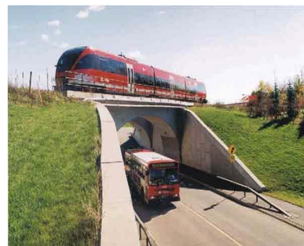
The O-Train connects to the Transitway at both ends of the line

The O-Train travels on an 8-km length of existing freight rail track, and connects to the city's bus rapid transit system (the "Transitway") on each end of the line. The existing corridor is owned by Canadian Pacific Railway (CPR). The line serves Carleton University, a major employment centre, and a shopping mall in a densely populated neighbourhood.